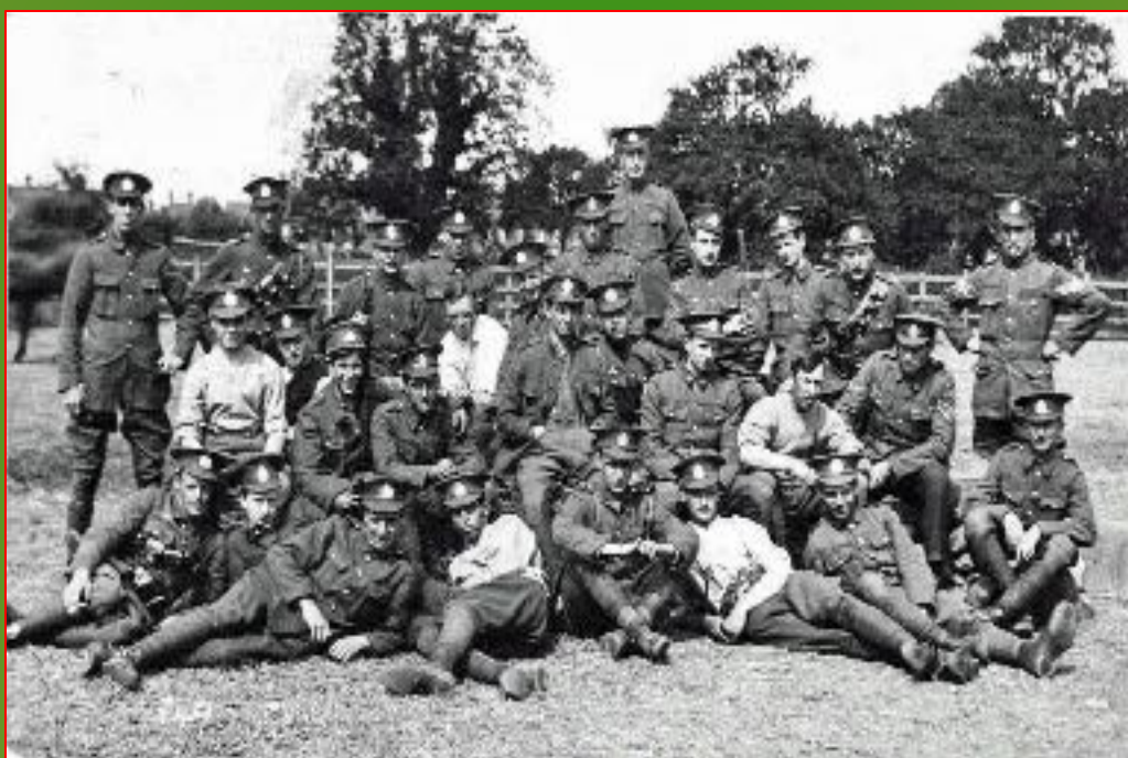
Company of Royal Fusiliers, relaxing at Swanton Morley, Norfolk, June 1915.